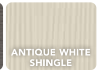
ANTIQUE WHITE SHINGLE