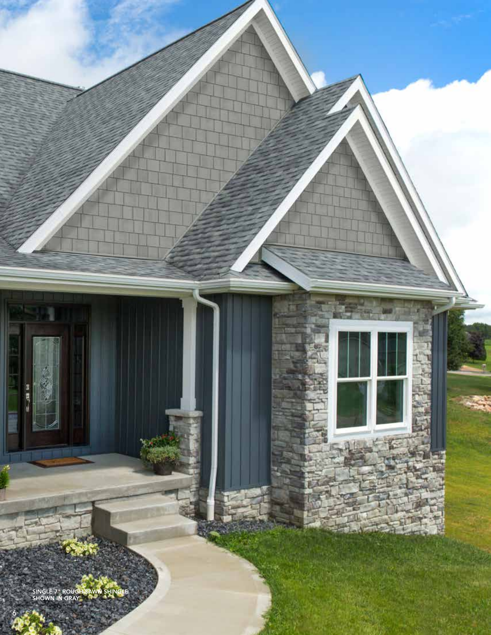
SINGLE 7" ROUGH SAWN SHINGLE SHOWN IN GRAY